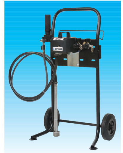
DVP-675 cart mounted standard pump