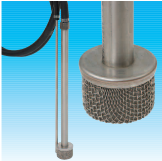
All suction tubes include stainless steel fluid strainers.