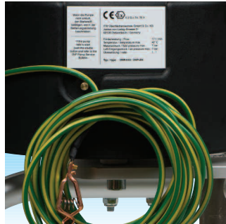
CE and ATEX approved with earthing cable as standard.