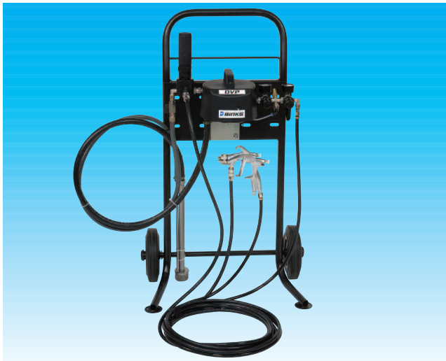
DVP-C-FLG5: Cart-mounted standard pump, fluid filter/bypass assembly, twin air regulators, 7.5m air and fluid hose, flexible suction wand and FLG5 Conventional Spray Gun†