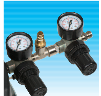
Twin air regulators provide independent control of the pump and spray gun pressures.