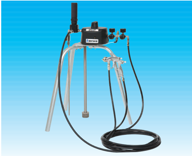
DVP-T-FLG5: Tripod-mounted standard pump, fluid filter/bypass assembly, twin air regulators, 7.5m air and fluid hose, stainless steel pick up tube and filter and FLG5 Conventional Spray Gun†

The DVP spray outfits are available with either Compact Trans-Tech® or FLG5 Trans-Tech® spray guns. They are delivered fully complete and ready to use apart from connecting the guns and hoses as necessary.