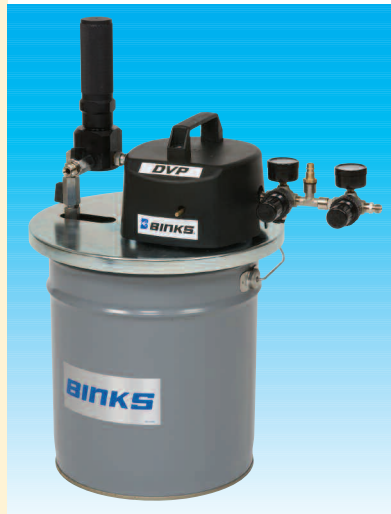
DVP-610-F pail mounted 25 litre standard pump. *Pail not included