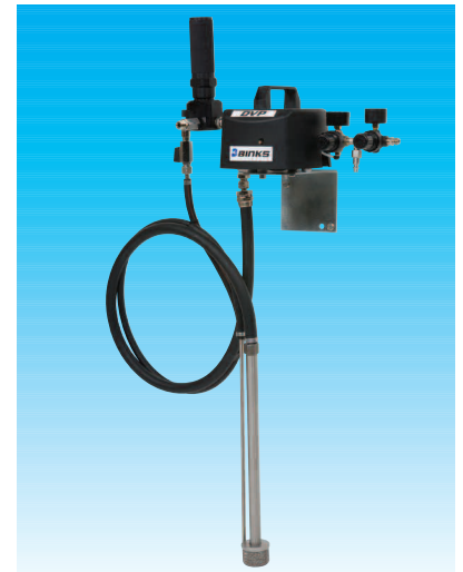
DVP-630-F wall mounted standard pump