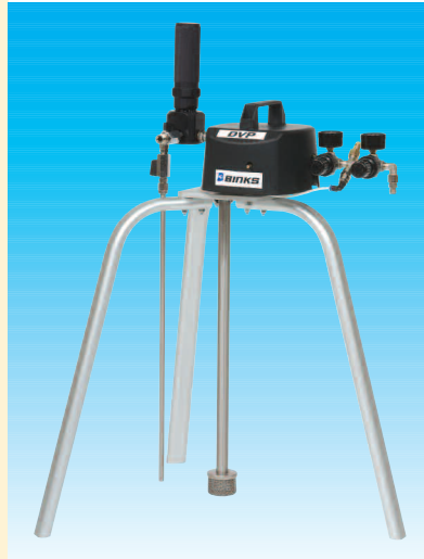
DVP-660 tripod mounted standard pump

Outfits include as standard, twin air regulators which independently control the pump and spray gun pressures, plus, an outlet fluid filter/bypass pressure dump assembly along with a flexible suction wand/filter assembly or a rigid inlet tube with filter to provide clean and filtered fluid to the spray gun. The fluid/material container can be constantly topped up whilst the pump is in operation, enabling all of the spray material to be used without waste, reducing downtime and assisting in quick and simple colour change operations.