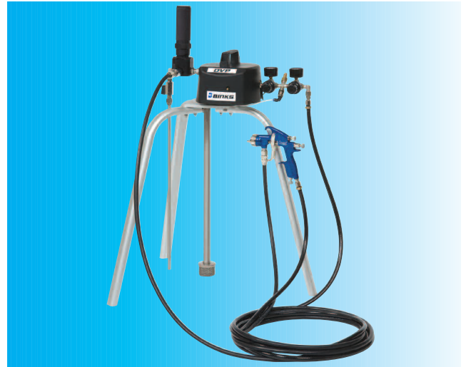
DVPAN-T-COMP: Tripod-mounted waterborne pump, fluid filter/ bypass assembly, twin air regulators, 7.5m air and fluid hoses, stainless steel pick up tube and filter and Compact Trans-Tech® Spray Gun*