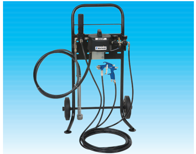
DVPAN-C-COMP: Cart-mounted waterborne pump, fluid filter/bypass assembly, twin air regulators, 7.5m air and fluid hoses, flexible suction wand and Compact Trans-Tech® Spray Gun*